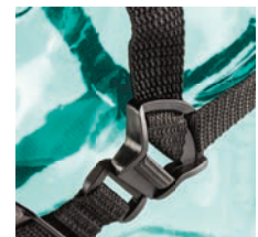
Secure but easy to release Headmount fastener

The Yukon NVMT Spartan 1x24 Goggle Kit is part of the most ergonomically designed, aesthetically pleasing, well featured and highest performing Gen 1 night vision monocular series on the market today and probably the most successful Gen 1 monocular goggle of all time. Powered by a single 3v Lithium CR123A Battery (not supplied), they are small, light and easy to use and have the versatility to add an array of optional accessories to suit different applications or enhance performance. All NVMT Spartan models are still the benchmark for budget night vision systems and continue to top best seller lists because of their performance and price.