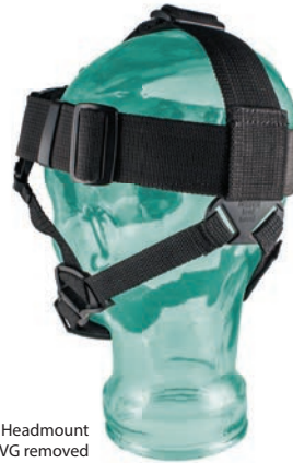
Rear view of Headmount with NVG removed