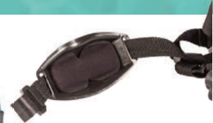
All points of contact are foam lined for a comfortable fit